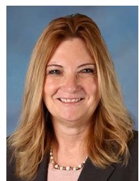
Heidi Nienow Ansary & Associates, WI